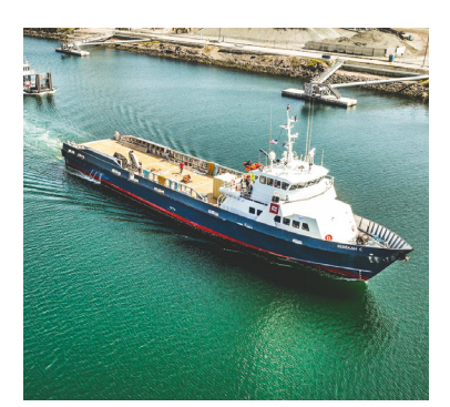
Rebekah C: Supply Boat: Length: 181' Beam: 34'