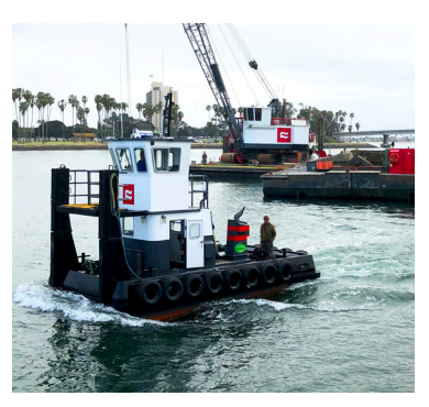
Baby T: Length: 45' Beam: 24'