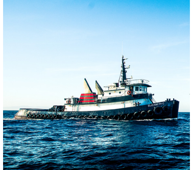
Elizabeth C: Ocean Tug: Length: 126' Beam: 34'