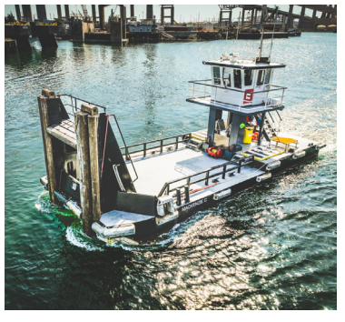
Mackenzie C: Length: 50'4" Beam: 20